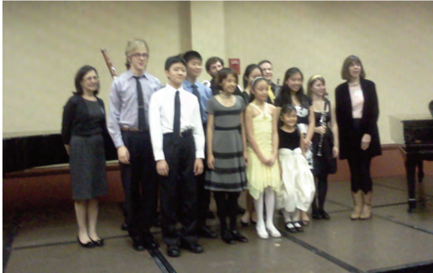
MTNA and MMTA Winners' Recital Sunday, October 16, 2011